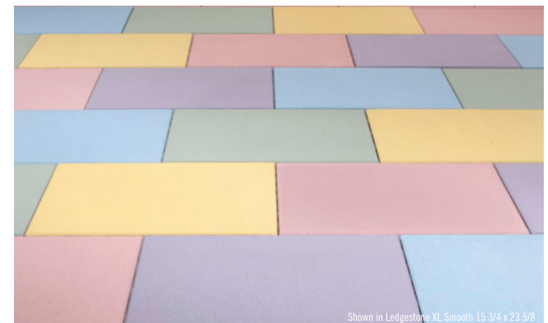
Shown in Ledgestone XL Smooth 15 3/4 x 23 5/8