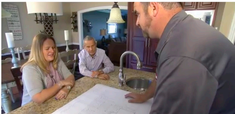
Hear from homeowners and colleagues in the field about their experience with project planning.

Please join us for our FREE Contractor Clinic & New Product Showcase