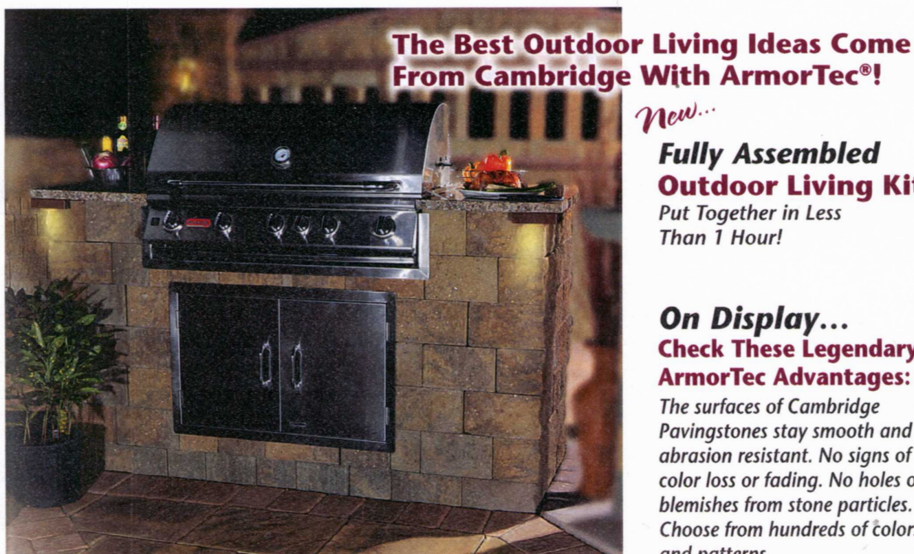
FREE!... 108-Page Cambridge Outdoor Living Idea & Color Guide!

Friday, July 25, 2014 11:30 AM - 1:30 PM